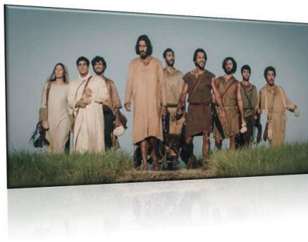
Based on the TV Series: The Chosen (season 2) Created by Dallas Jenkins

Season 1, What does it mean to be Chosen, is available on TheChosen.tv, YouTube and others. It is also currently on Netflix.